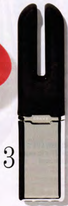
3 CRAVE DUET ($149, lovecrave.com )

A futuristic take on the traditional bullet. "Like the sex-toy equivalent of E.T., it quietly phones home—I put it on the highest power and let the flat spaceship side rove on my clitoris during a...solo expedition," reports Genevieve S., 21. Plus, it powers up via a magnetic charger—no batteries necessary—so it'll never die right before you're about to lift off.