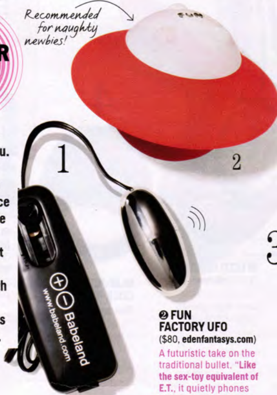
1 BABELAND SILVER BULLET ($15, babeland.com )

"Two inches of pure sexual secret weapon. Use it alone, or pulse it on your clitoris during sex. Turn the speed up and never fake an orgasm again. It's the little black dress of sex toys. Everyone needs one." —Ann M., 32*